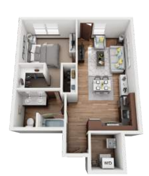
MILLER 1 BED/1 BATH