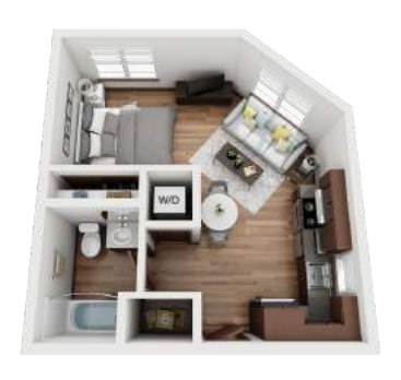
MCPHERSON STUDIO/1 BATH