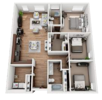
LINDEN 3 BEDS/ 2 BATHS