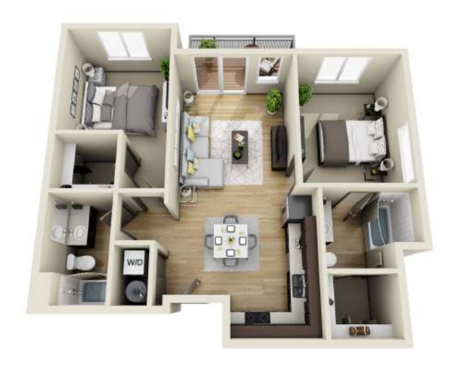
2A 2 BEDS/ 2 BATHS