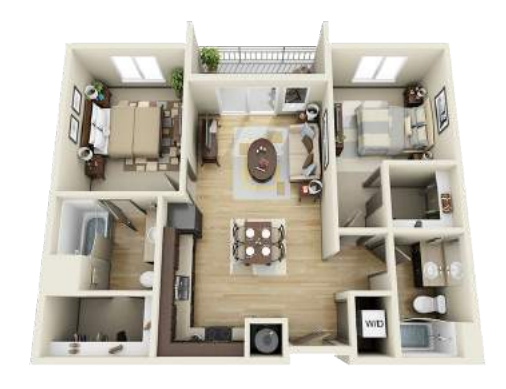
SANTA FE 2 BEDS/ 2 BATHS