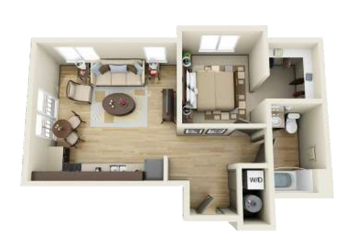
SCOUT 1 BED/1 BATH