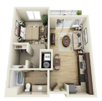
ASPEN 1 BED/1 BATH