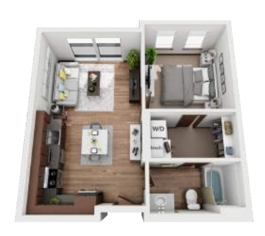
WALNUT 1 BED/1 BATH