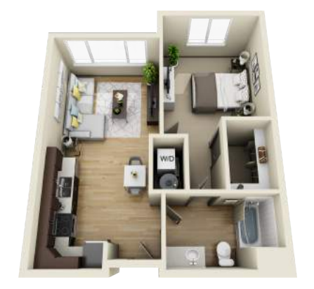
1B 1 BED/1 BATH