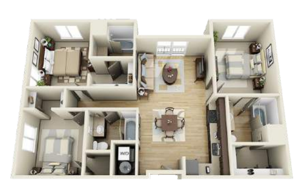
GREATWESTERN 3 BEDS/3 BATHS