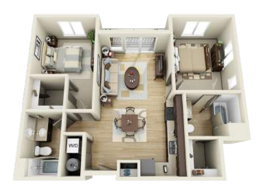
STATEMAN 2 BEDS/2 BATHS