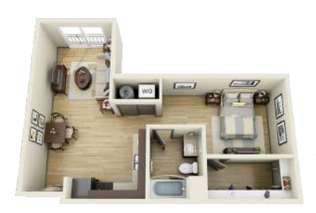
OVERNIGHTER STUDIO/1 BATH