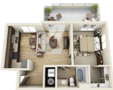
ZEPHYR 1 BED/1 BATH