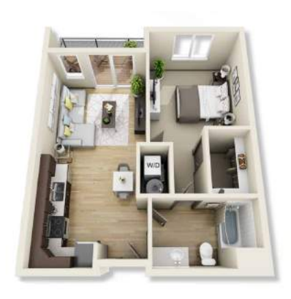
1A 1 BED/1 BATH