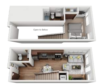
MAGNOLIA 1 BED/ 1.5 BATHS