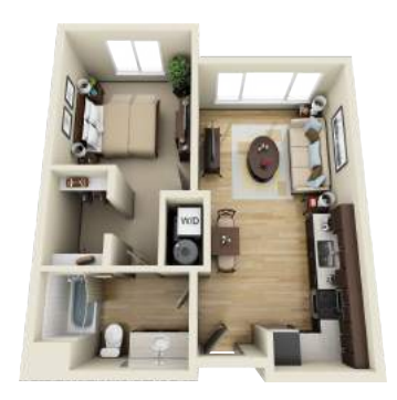
ASPEN II 1 BED/1 BATH