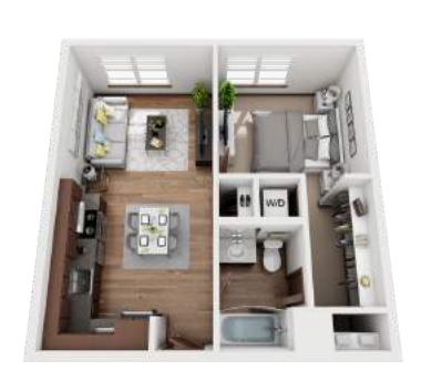
AVERY 1 BED/1 BATH