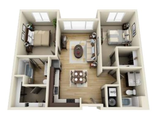
SANTA FE II 2 BEDS/ 2 BATHS