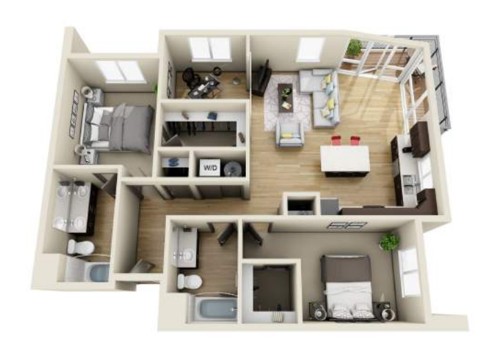
2B 2 BEDS/2 BATHS