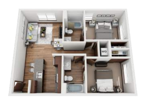
CHERRY 2 BEDS/ 2 BATHS