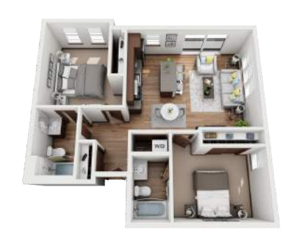
CANYON 2 BEDS/ 2 BATHS