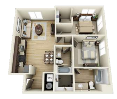
BURLINGTON 2 BEDS/ 2 BATHS